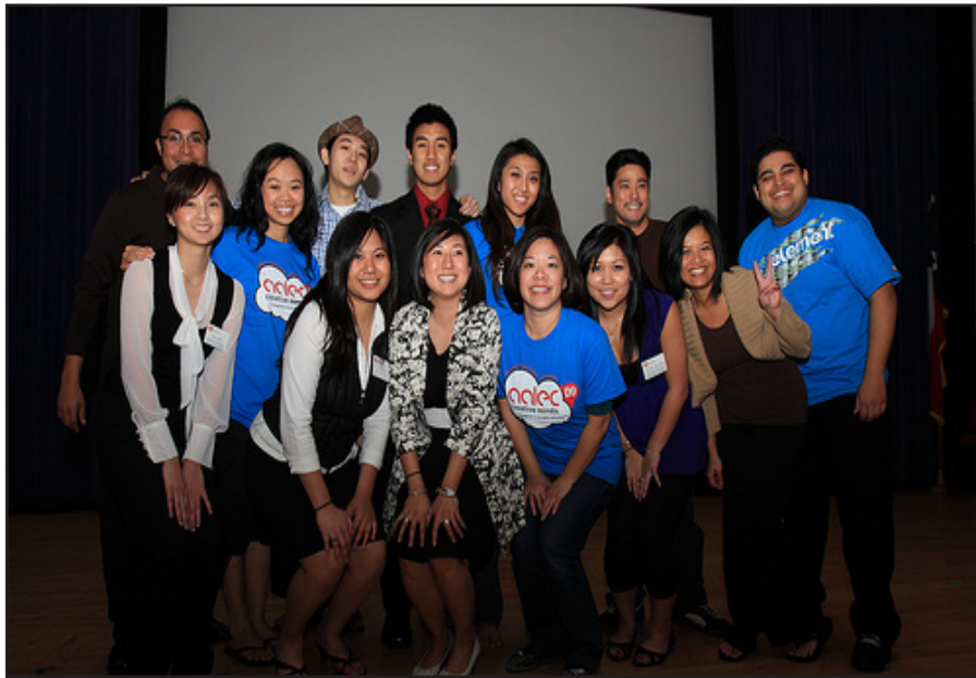
AALEC Exec with HereandNow Theatre Company

you know that words just can't describe it sometimes. AALEC prides itself in being a conference