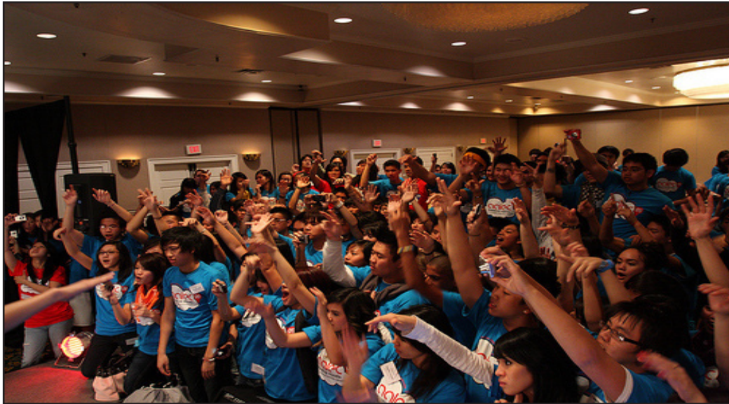
AALEC Participants Cheering

only do the participants have a great time making memories and friendships with their peers while they're having the time of their lives, but they all take away a positive message and attitude about who they are and what they're able to accomplish after